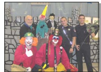
Life and Fire Safety program

To learn more about these and other area nonprofit organizations, visit the Nonprofit Directory on the Community Foundation's website at www.cfsgwc.org/directory . Upcoming grant funding from the Community Foundation Littler Youth Fund will include Teacher Mini-Grants for eligible educators in Weld County and operational grants for nonprofit organizations that support youth programs in Weld County. Please visit our website at www.cfsgwc.org/grants for upcoming grant deadlines or for more information, contact us at (970) 304-9970. The Teacher Mini-Grant and Nonprofit Operational Grant applications are available online or at our office located at 711 8th Avenue, Greeley, CO 80631.