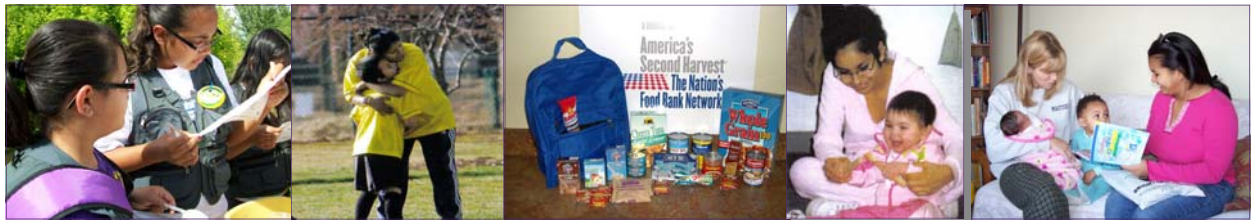
Poudre Learning Center El Espejo program